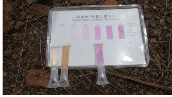
Results of simple Cr(VI) detector tube test.

The 1st (point A in the above map) (Trace) and 2nd (point B) (0.05 mg/L) ones from left side were on the Oko-Oko River (Photo: October 28, 2022)