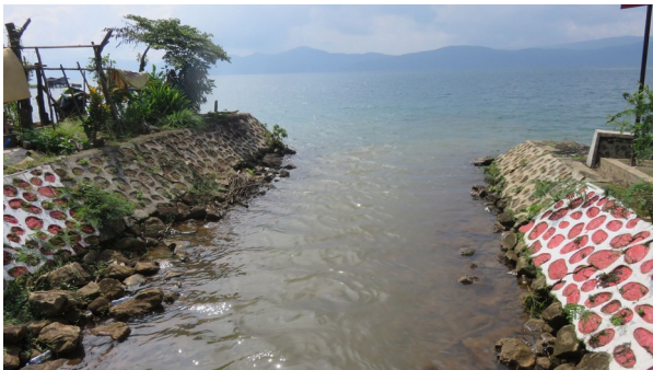
The Lawewu River (downstream) flowing to Lake Matano. (Photo: July 20, 2022)