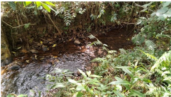
The Lawewu River (upstream, near the