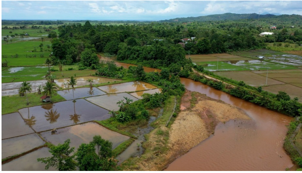
The Oko-Oko River used for irrigation water (Photo: October 28, 2022)