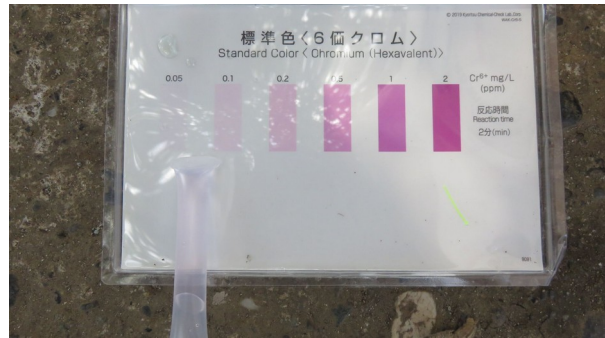
Results of simple Cr(VI) detector tube test at the Lawewu River (downstream) (0.075 mg/L) (Photo: July 20, 2022)